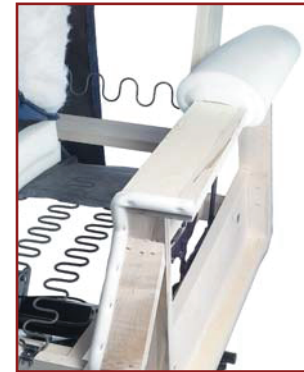
501 M shown

Each luxury lift & recline chair is hand crafted in our facility using decades of motion furniture experience.