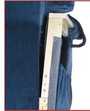
501 M shown